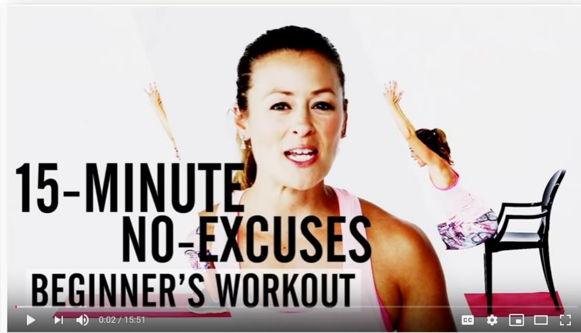
The Best 15-Minute Beginner Workout – No Equipment Needed | Class FitSugar